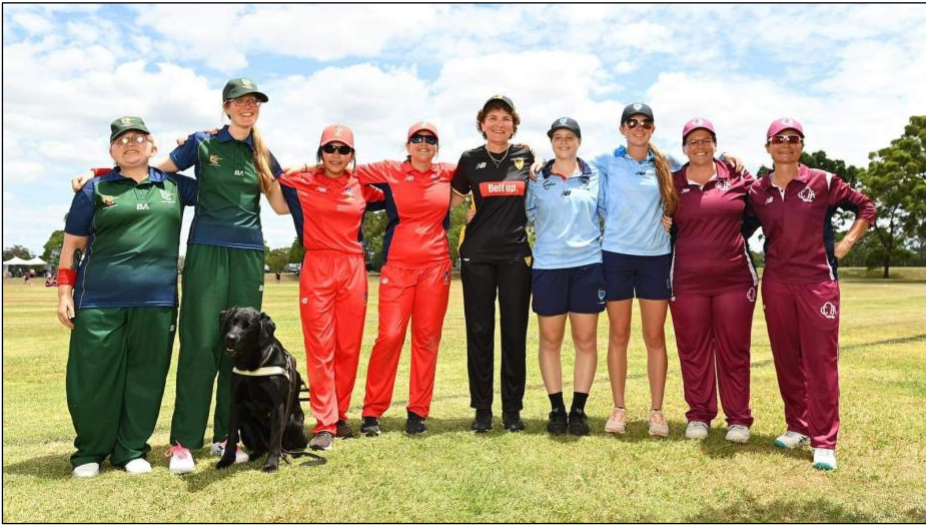
Women players from five States (left) and the Victorian Deaf team (below, middle) celebrating their Grand Final win.