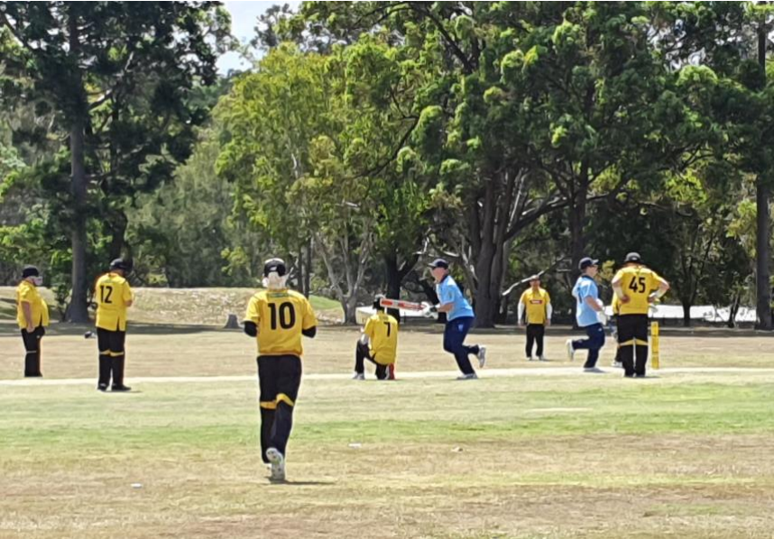
Blind Cricket action featuring NSW v WA in the Final, (top left), VIC and QLD